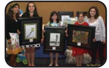
Thank you for supporting our children artwork!