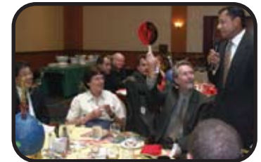
Thank you all guests for supporting our 15th Annual Dinner and Auction Gala.